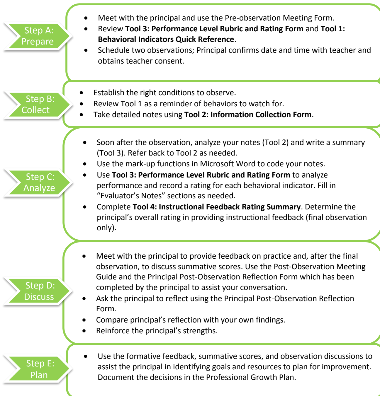
Figure 2. Overview of the Five Steps

As an observer, your work is organized in five steps: prepare, collect, analyze, discuss, and plan. Figure 2 provides an overview of the steps. Your observation of principal practice will be fair and consistent only to the extent that you carefully prepare for and follow the procedures outlined in this manual. A minimum of two instructional feedback observations for each principal is required as part of the U.S. Virgin Islands annual principal evaluation process.