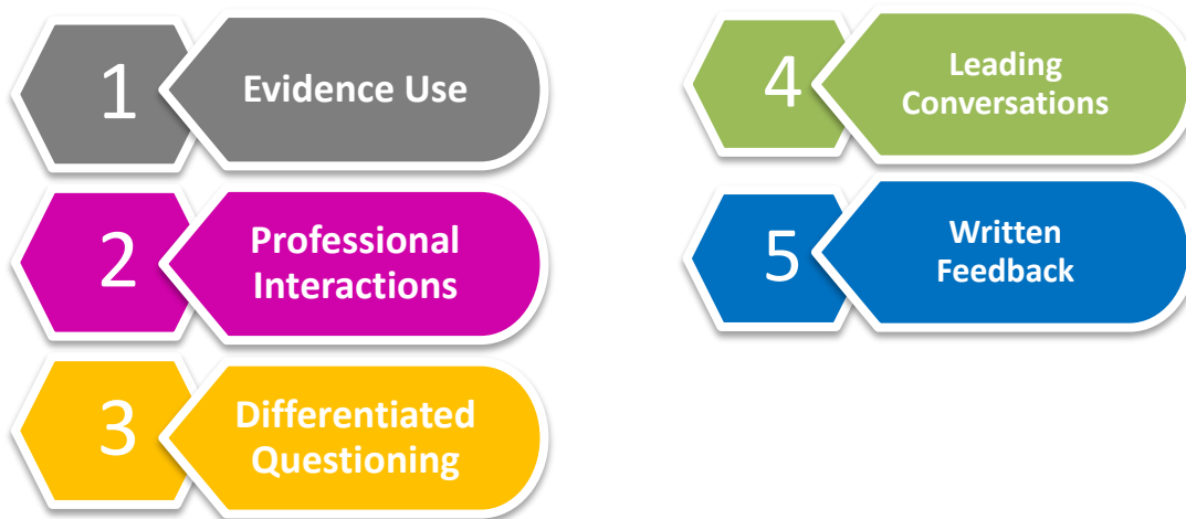
Figure 3. Behavioral Indicators for Instructional Feedback

The rubric uses a four-point scale to score principals: